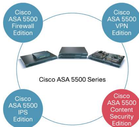
Figure 2. Complementary Solutions

Cisco Systems® and its partners offer world-class service and support tailored for your business. Cisco has adopted a lifecycle approach to services that addresses the necessary set of requirements for deploying and operating Cisco ASA 5500 Series security appliances. This approach can help you improve your network's business value and return on investment. For more information on Cisco security services, visit http://www.cisco.com/en/US/products/svcs/ps2961/ps2952/serv_group_home.html .