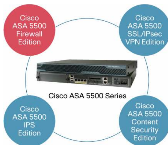
Figure 2. Complementary Solutions