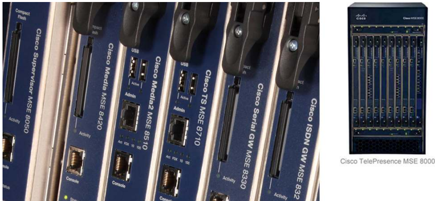
Figure 1. Cisco TelePresence MSE 8000