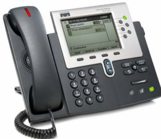
Figure 1. Cisco Unified IP Phone 7961G

The Cisco Unified IP Phone 7961G, an important addition to the Cisco Systems® award-winning IP phone portfolio, is a full-featured, enhanced manager IP phone. It is designed to meet the needs of managers and administrative assistants (Figure 1). It provides six programmable backlit line/feature buttons and four interactive soft keys that guide a user through call features and functions, and audio controls for high-quality duplex speakerphone, handset, and headset. A built-in headset port and an integrated Ethernet switch are standard with the Cisco Unified IP Phone 7961G. The phone also features a best-of-class large, higher-resolution grayscale pixel-based LCD (Figure 2). The display provides features such as date and time, calling party name, calling party number, and digits dialed. The crisp graphic capability of the display allows for the inclusion of higher value, more visibly rich Extensible Markup Language (XML) applications and double-byte languages.