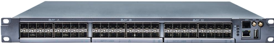
Figure 1. Cisco Nexus 3550-F HPT

Many users rate our CLI (Command Line Interface) as one of the best they have used. Every command available on the CLI is also available via a remote JSON RPC API. This makes the switch easy to operate and to manage at scale. All Cisco Nexus 3550-F platforms and switches include standard enterprise manageability and deployability features, including automatic configuration (via DHCP), SNMP, TACACS+ authentication, onboard Python programmability, BASH shell access, and time-series logging.